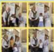
Taking part in community competitions, like Colwyn in Bloom.