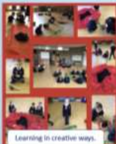
Learning in creative ways.