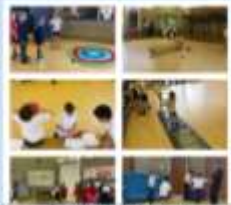
Transition to high school opportunities from Y4 upwards.