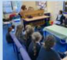
Sharing and celebrating our musical talents