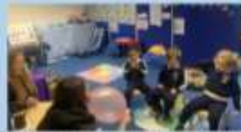
Our nurture room to further support pupils in a stimulating environment.