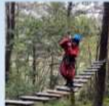
Residential trips to build confidence and develop teambuilding