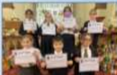
The GIFT Team leading worship opportunities in our school

Our goal is to support and nurture in order to develop well rounded, confident and responsible individuals who aspire to achieve their full potential.