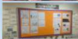
Celebrating topical events such as Black History Months.