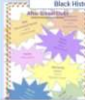
Staff offering a wide range of extra curricular clubs to spark interest.