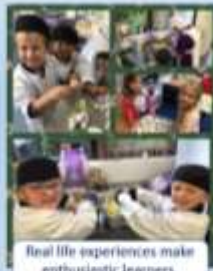
Real life experiences make enthusiastic learners.

Our vision for each child is to develop a curiosity of learning, discover their interests and help them grow in their love of learning; to be responsible citizens and to make a difference. We aim to equip our pupils with the skills and mind set to thrive and take on the world.