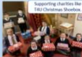
Supporting charities like T&U Christmas Shoebox.