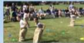
Whole school sporting competitions in our house teams.