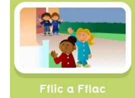
Fflic a Fflac